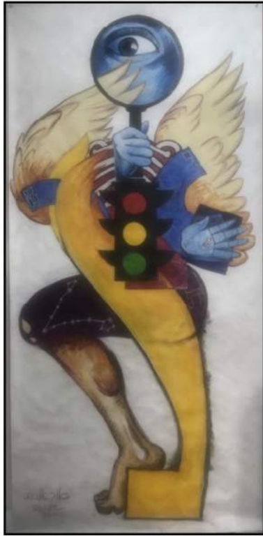
אוריאל • URIEL