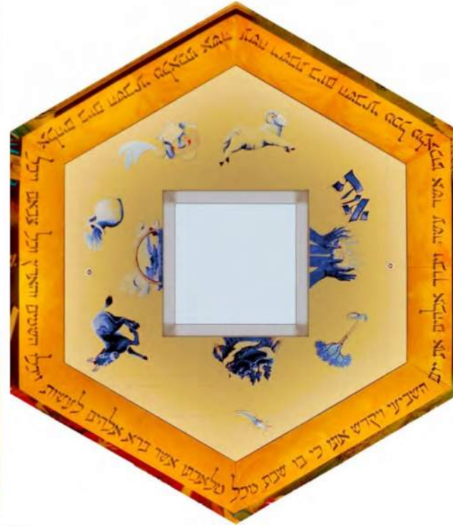
Rainer Waldman Adkins, Details, Seven Days of Creation Mural, Congregation Beth Shalom, Acrylic on Panel