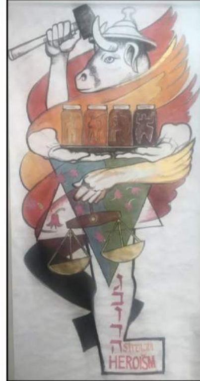
גבריאל • GAVRIEL